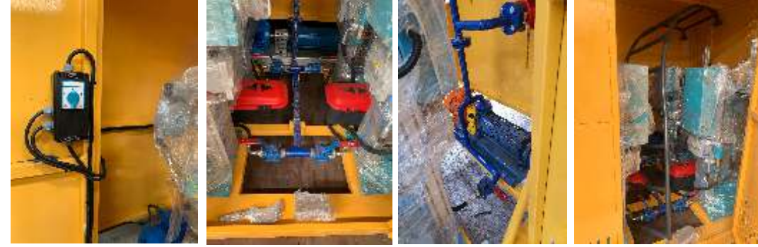
35 m 3 SKID SYSTEM TANK MODEL